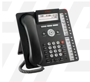
1616—I IP Deskphone