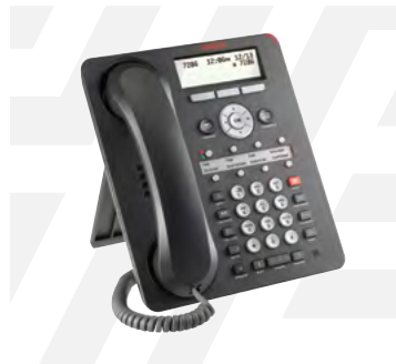
1608—I IP Deskphone