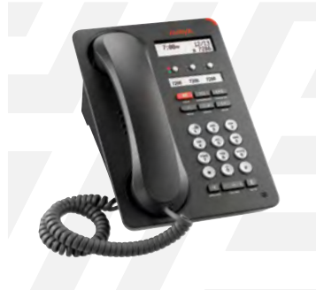
1603—I IP Deskphone 1603SW—I IP Deskphone