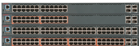
ERS 5900 Stackable Chassis