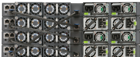
Rear View (highlighting Stackable Chassis cabling)