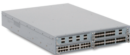
VSP 8400 4-Slot Ethernet Switch

The VSP 8400 shares the same next-generation hardware and software technology basis as the existing VSP 8200 Series. This positions the product line to support both today's requirements and tomorrow's emerging needs. The VSP 8000 Series provides business with a future-ready solution that leverages the Industry's most software-definable network virtualization technology.