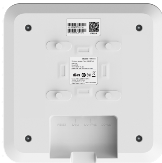
Figure 1-2 RG-RAP2260(G)