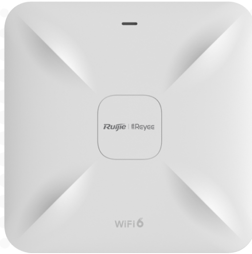
Figure 1-1 RG-RAP2260(G)